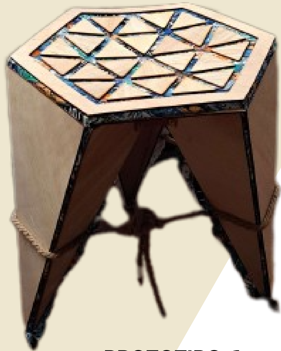
• PROTOTIPO 1