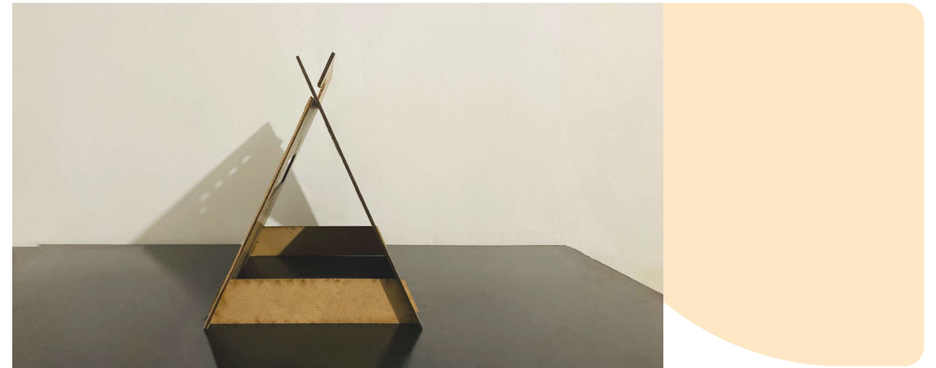
VISTAS REALES DEL CORRAL