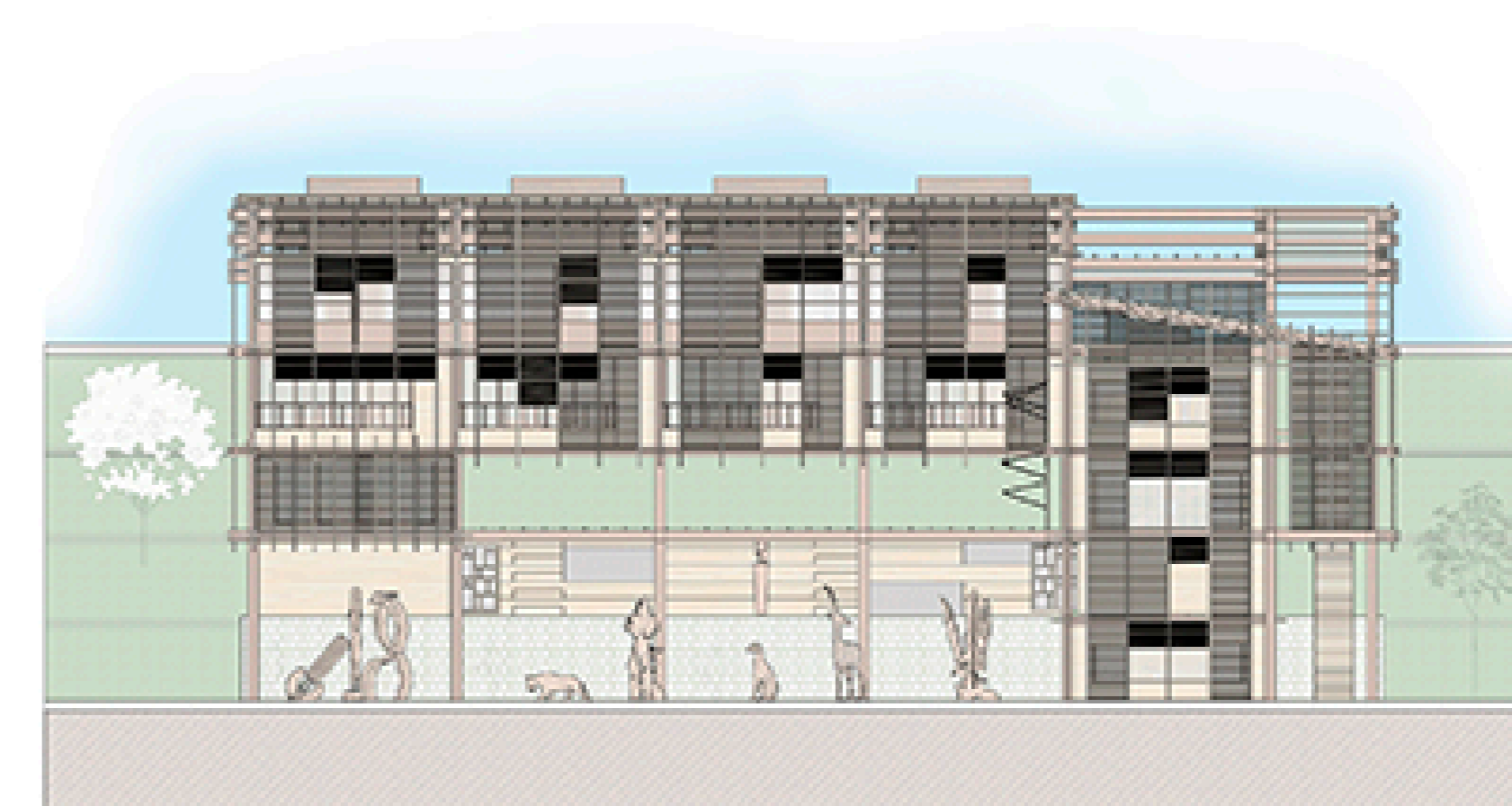
VISTA FRONTAL ESC. 1:100