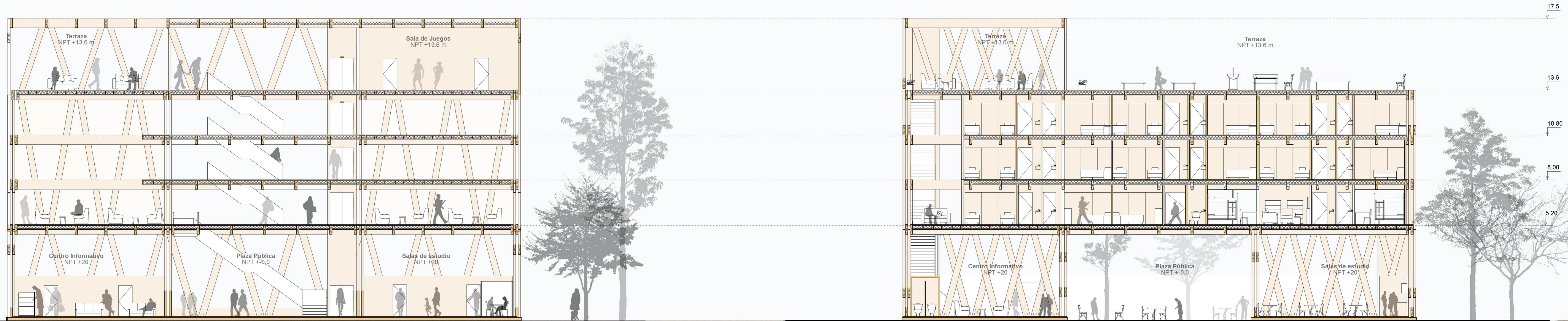
Corte A - A' Esc 1:100