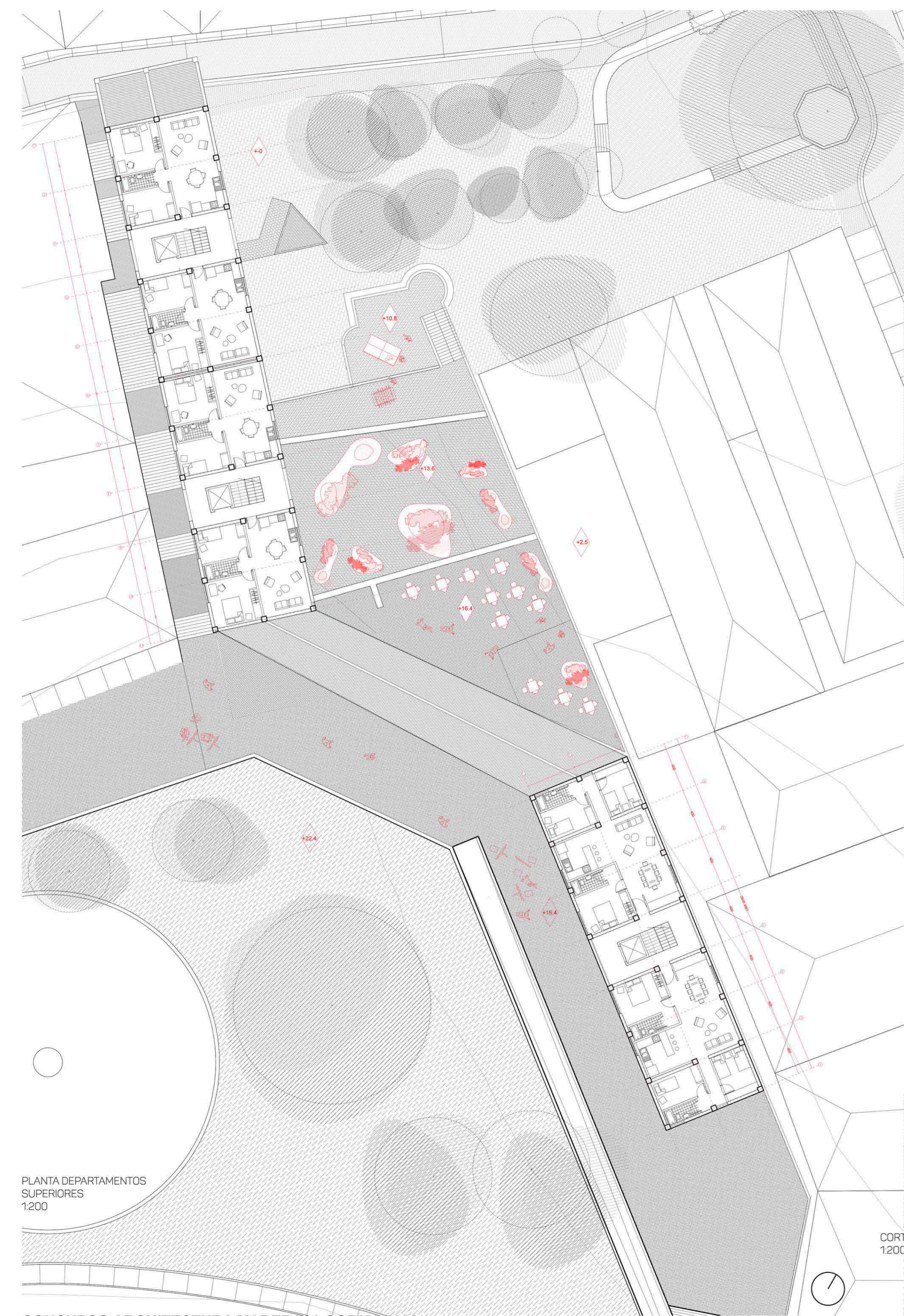
PLANTA DEPARTAMENTOS SUPERIORES 1:200