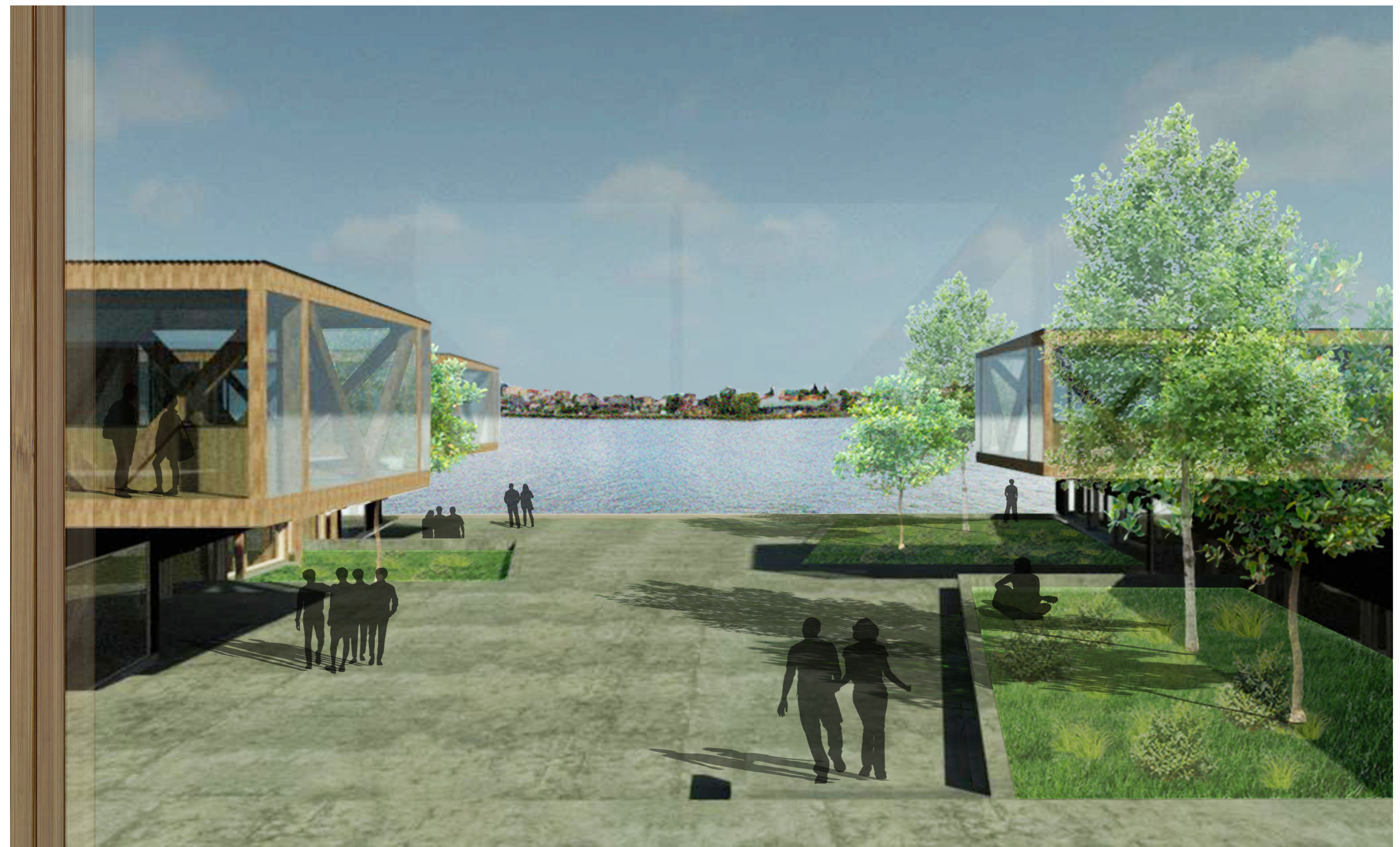
Vista Patio Central