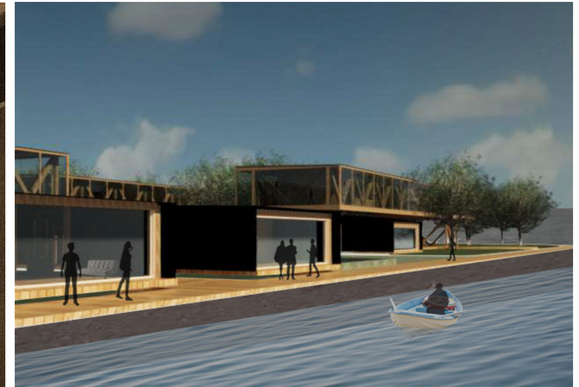
Vista Paseo Costero