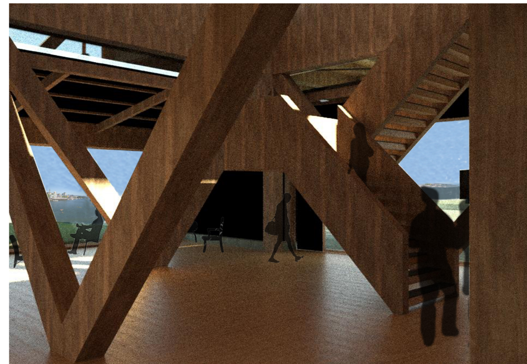
Vista Interior Hall