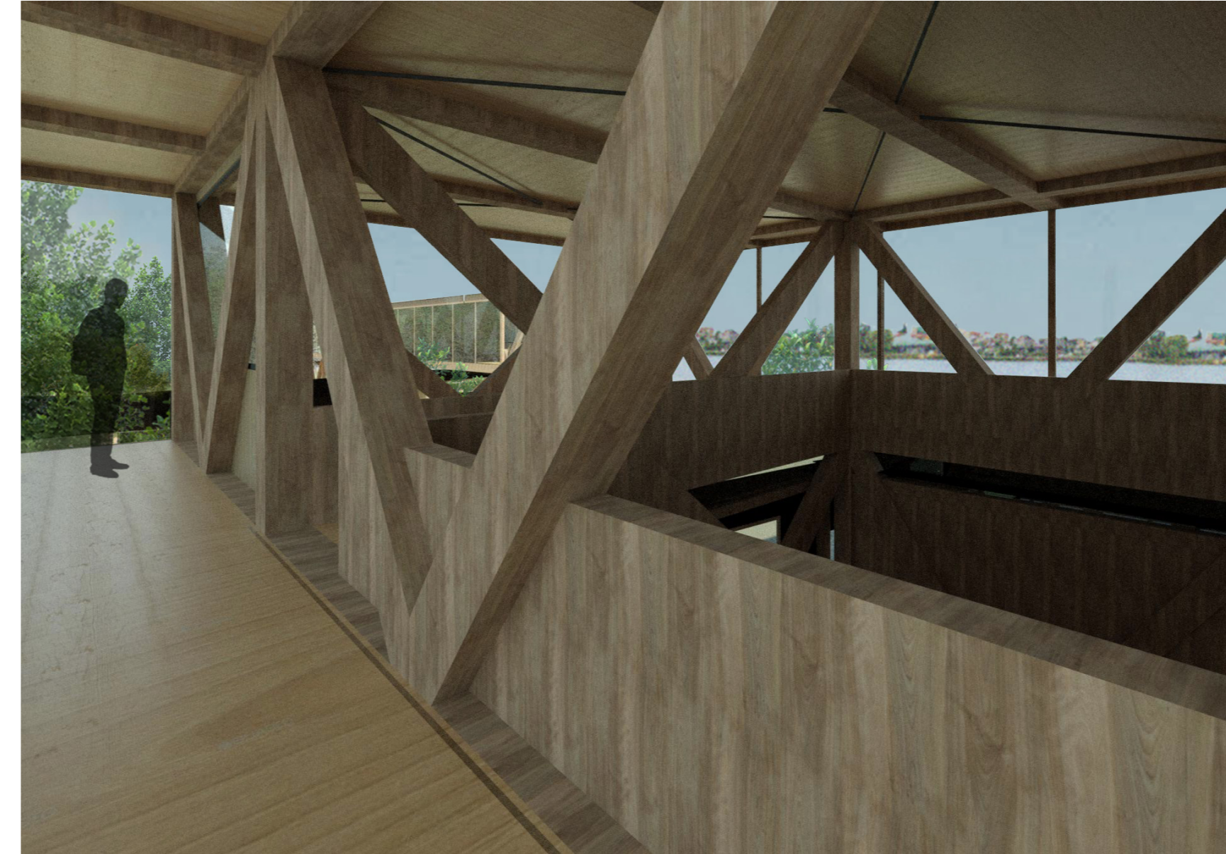
Vista Interior Puente