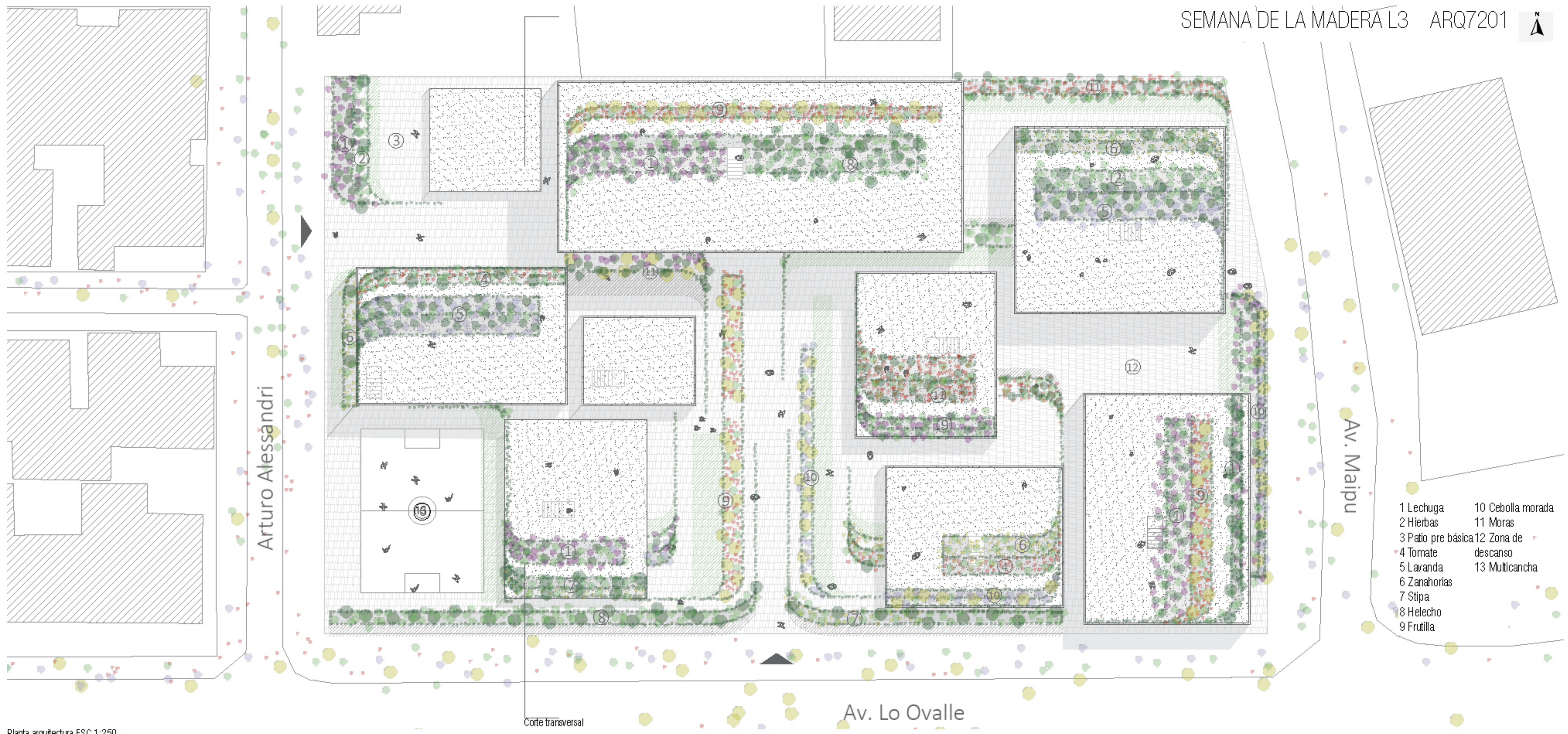
Planta arquitectura ESC 1:250