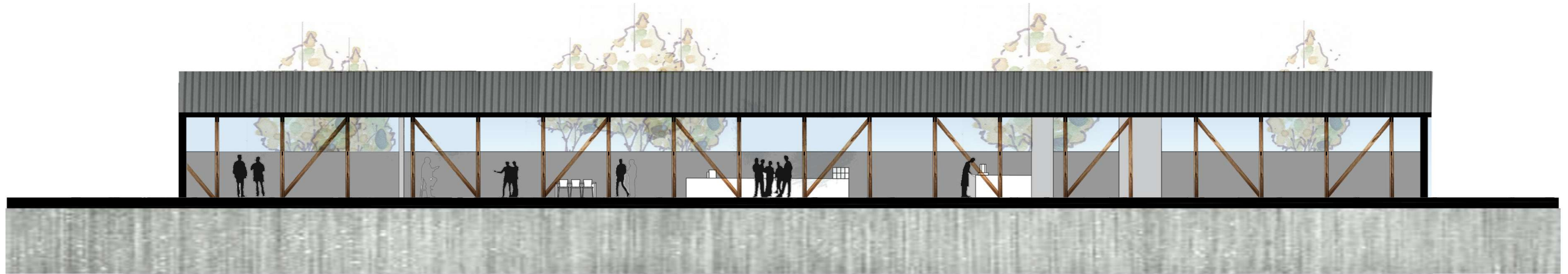
CORTE A-A' ESCALA 1/100