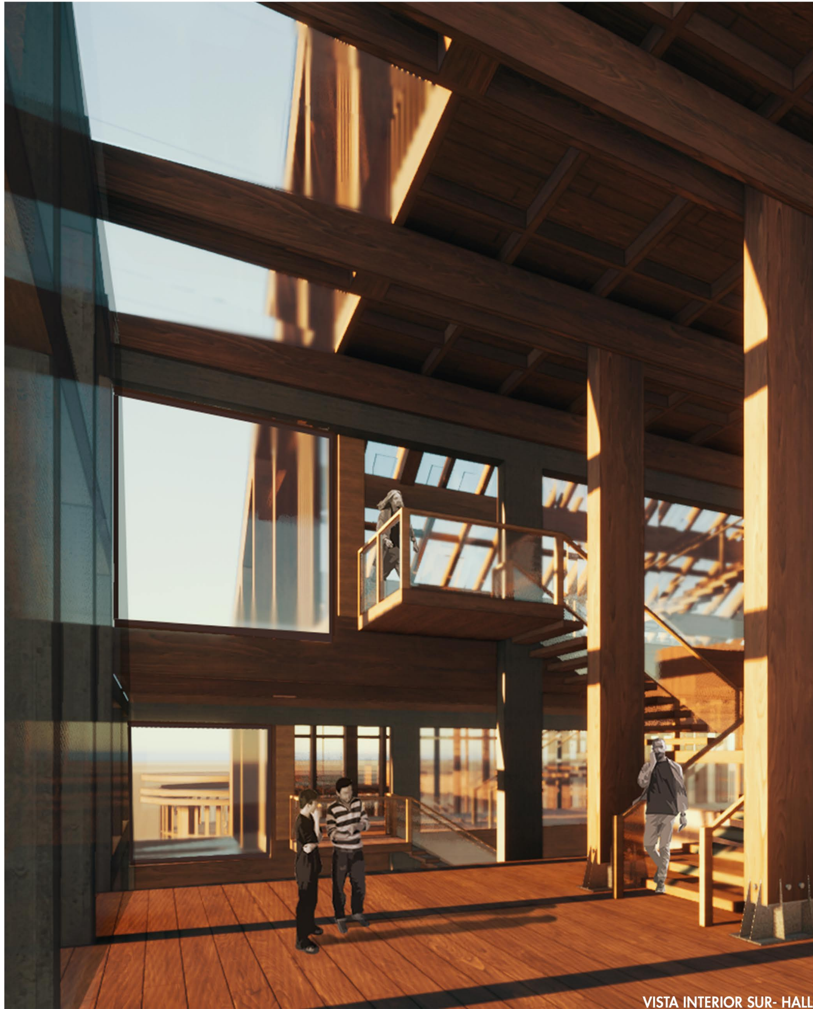
VISTA INTERIOR SUR- HALL