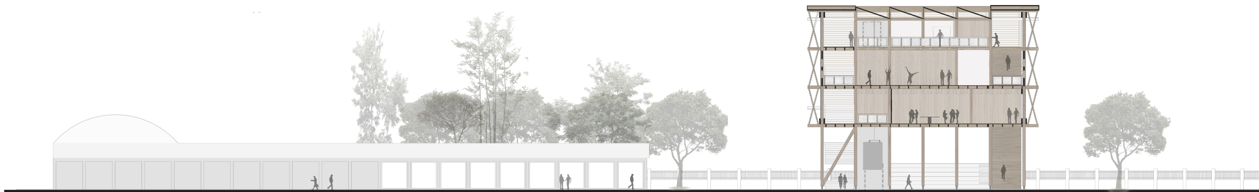
Corte A-A' Escala 1:200